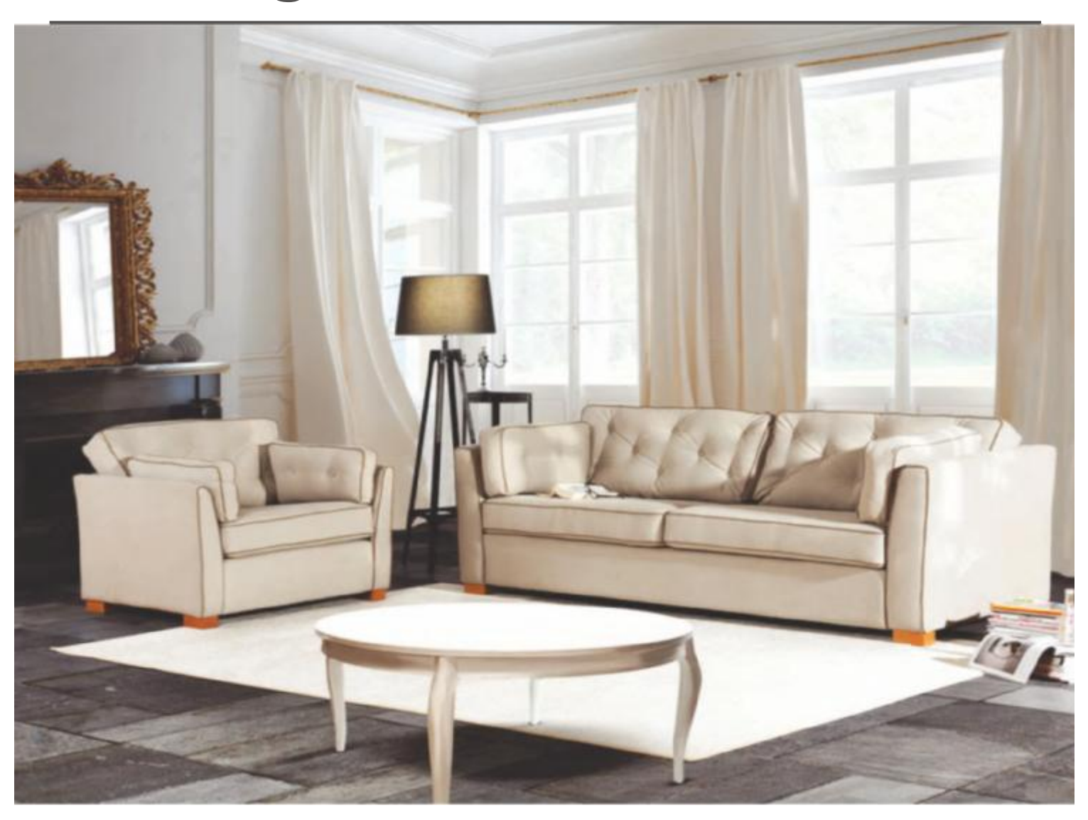
Danzing 3 Sofa + 1,5 Chair