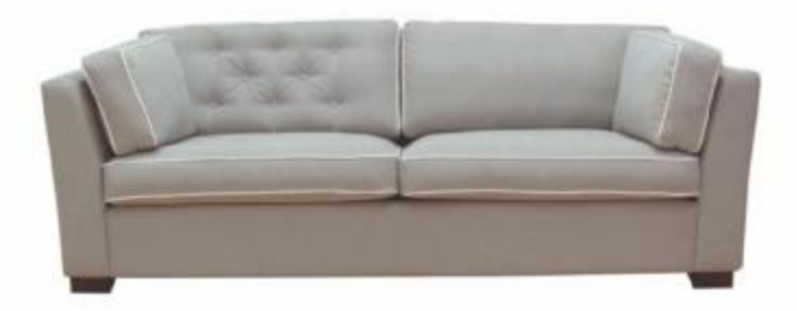
Danzing back combination