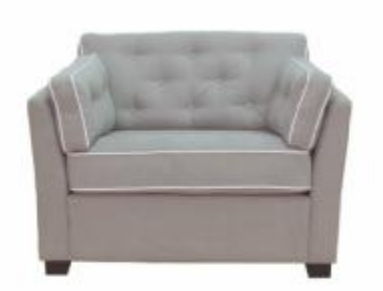
Danzing 1 Chair