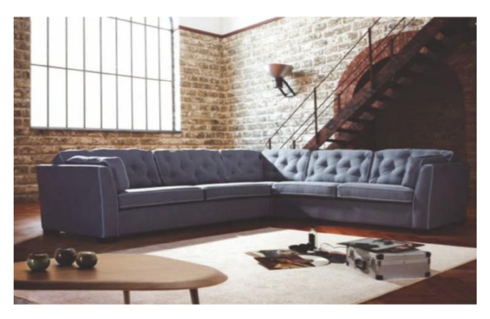
Danzing 3 PLC2,5 PR