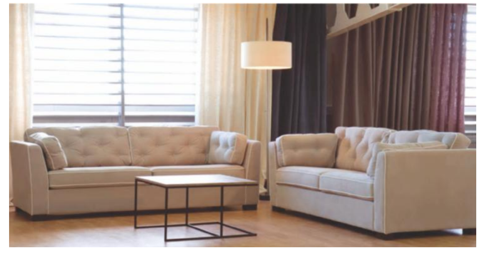
Danzing 3 Sofa + 2,5 Sofa